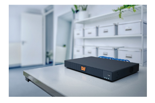
1 Connect your COVA to devices and power.

Choose what to detect and where with a user-friendly and straightforward UI, set up multiple scenarios specific to your monitoring needs without complex calibration.