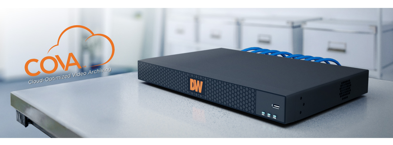
Cloud Optimized Video Archiving