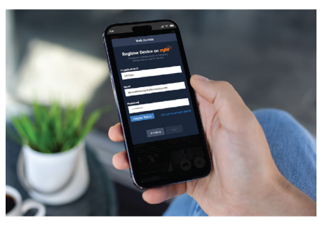
Register your COVA to your myDW account.