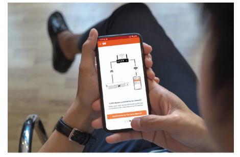
2 Use the DW Mobile+ app to find your COVA.