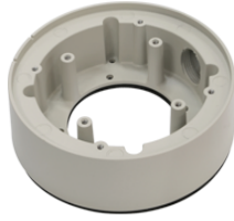
DWC-V1JUNC Junction box