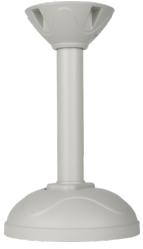
DWC-V1CM Ceiling mount