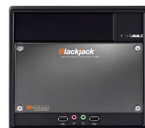
DW-BJCLIENT1 / DW-BJCLIENT2 Blackjack® workstation